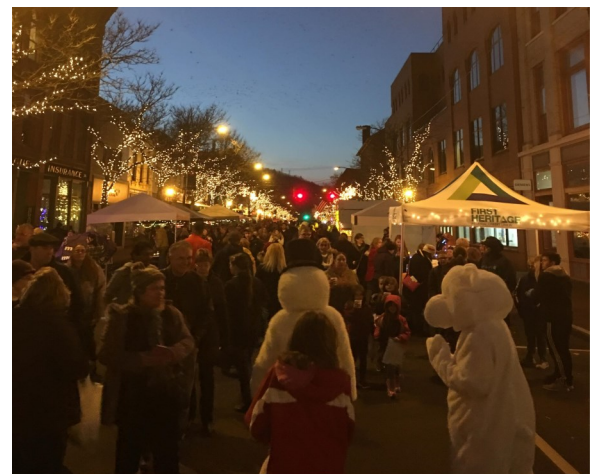
Market Street on that evening.