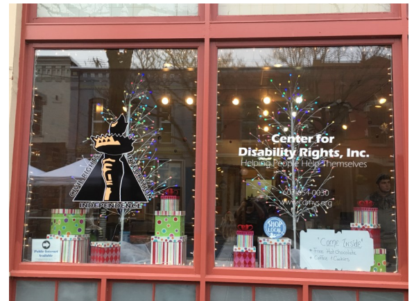
The Corning office, decorated for the SPARKLE event.