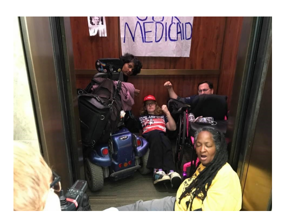
Rochester ADAPT members taking over an elevator at Senator Portman's office in OH.

On July 6<sup>th</sup>, over 20 advocates got on a bus in the middle of the night to head to Columbus, Ohio to