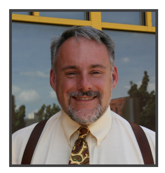
Center for Disability Rights works to ensure the full integration, independence and civil rights of people with disabilities and seniors in the community.